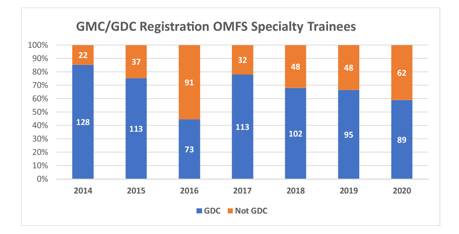
Fig. 2. Changes of GMC and GDC Registration of OMFS specialty trainees with time.