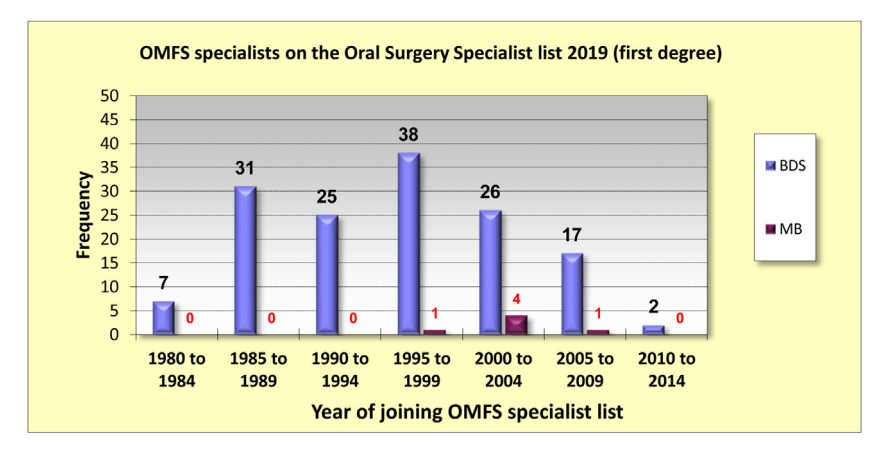
Fig. 3. OMFS specialists on Oral Surgery list by year that specialist completed training.

requested the GDC commit to providing proforma letters regarding the registrability of trainee's dental qualification for the next 5 years which give security to those who let their dental registration lapse. Following this request the GDC immediately ceased providing the agreed proforma letter. This has caused some difficulty for trainees as either presence on the register or a letter from the